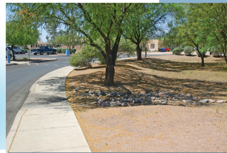
Larger water harvesting/detention area, similar treatment could occur in areas of excess right-of-way.