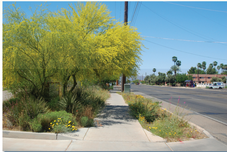
Minimal passive water harvesting landscape strip between sidewalk and street.