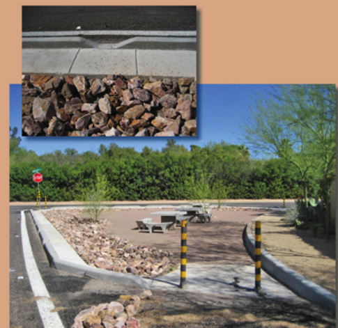
Rainwater harvesting integrated into small park space.