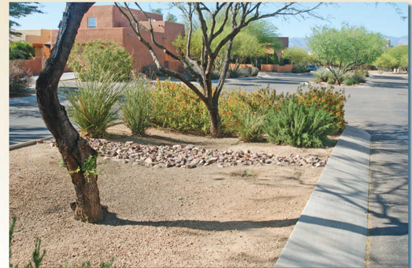
Passive water harvesting in median, similar to side median in 160' right-of-way.

Opportunities to irrigate Grant Road’s landscaping with rainwater are being maximized through the design of landscaped areas and roadway. Water harvesting concepts are being developed to capture rainwater that falls within the Grant Road right-of-way so it can be directed to landscaped areas to improve the health and vitality of the landscape.