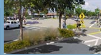
Indirect Left Turn

Access and mobility on the new Grant Road will be improved with a center median with openings dividing the east and west travel lanes.