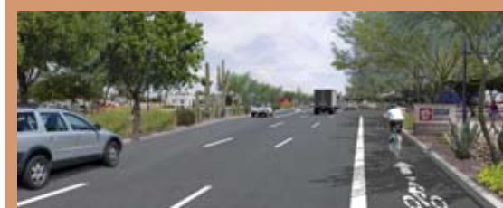
Conception of Grant Road near Oracle