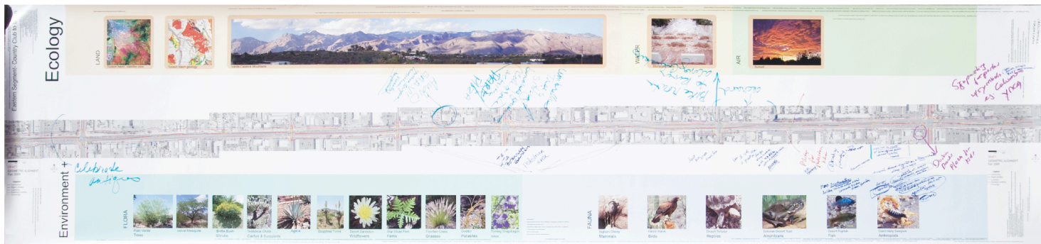
Country Club to Swan: Environment + Ecology Map