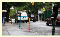
ANOMALY & LINE- Meter Cozies Along a Path Site Specific Integrated Temporary