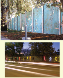
PLANE- Wall + Light Media + Integrated