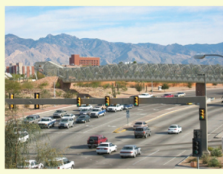
SPACE- Outdoor Passageway/ Bridge Functional