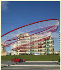
POINT- Object + Site Specific