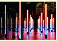
ANOMALY & SPACE- Outdoor Room + Lights Site Specific Media