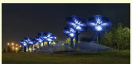
LINE & ANOMALY- Unique Multiple Objects Along Roadway (Solar Powered "Flower" Lights) Media Functional Site Specific