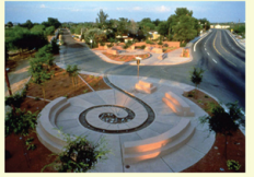
SPACE- Gathering Spot + Part of Landscape & Benches Functional Site Specific