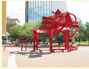
POINT- Object & Bench Functional