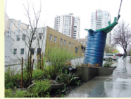
ANOMALY & LINE- About the Landscape + Water Catchment Site Specific Functional