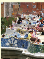
LINE & SPACE- Along a Path + Gathering Spot & Bench Functional Site Specific Integrated