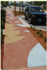
PLANE- Ground + Part of Walk Integrated