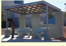
PLANE- Ceiling Plane