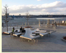
PLANE & SPACE- Conversation Table + Chairs with Roof (Ceiling) Functional Site Specific