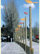
LINE- Multiples Along a Path Barrier & Wind Vanes Site Specific Functional