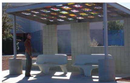
Shade Structure: Artists - Geoff DeMark and Simon Donovan, Location - El Pueblo Senior Center, 101 West Irvington Road, Completed - 2005