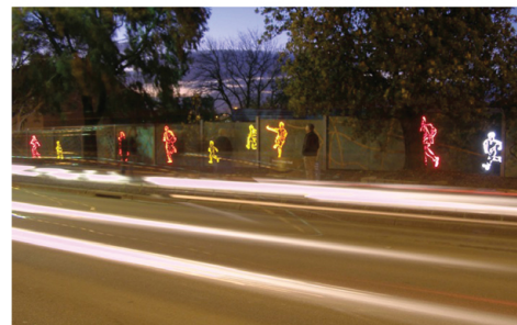
Wall and light media integrated with public art: Artist - Dan Corson