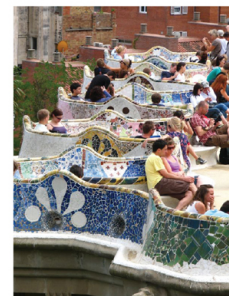
Serpentine Bench at Güell Park: Artist - Antonio Gaudi, Location - Barcelona, Spain