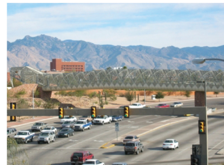
Diamondback Bridge: Artist - Simon Donovan, Location - Broadway Boulevard, west of Euclid Avenue