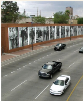
Windows to the Past, Gateway to the Future: Artist - Stephen Farley, Location - Broadway Boulevard Underpass into Downtown, east of Fourth Avenue, Completed - 1999, Glazed ceramic tiles