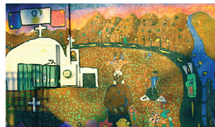
Our Yaqui Culture: Location - Old Pasqua Church Plaza Designed and painted by children in the KIDCO program. This project was a collaboration between the old Pasqua Neighborhood Center, KIDCO, The American Indian Association, The Tucson Indian Center and the Tucson Arts Brigade.