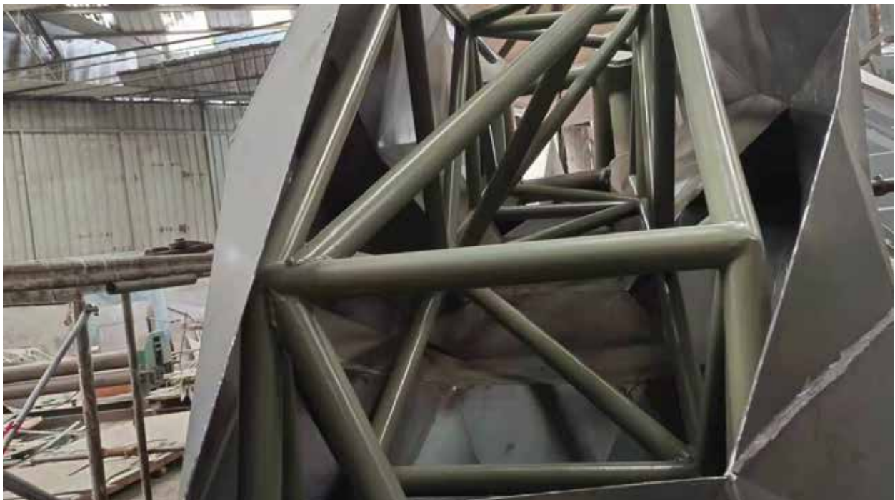
Internal frame inside shell