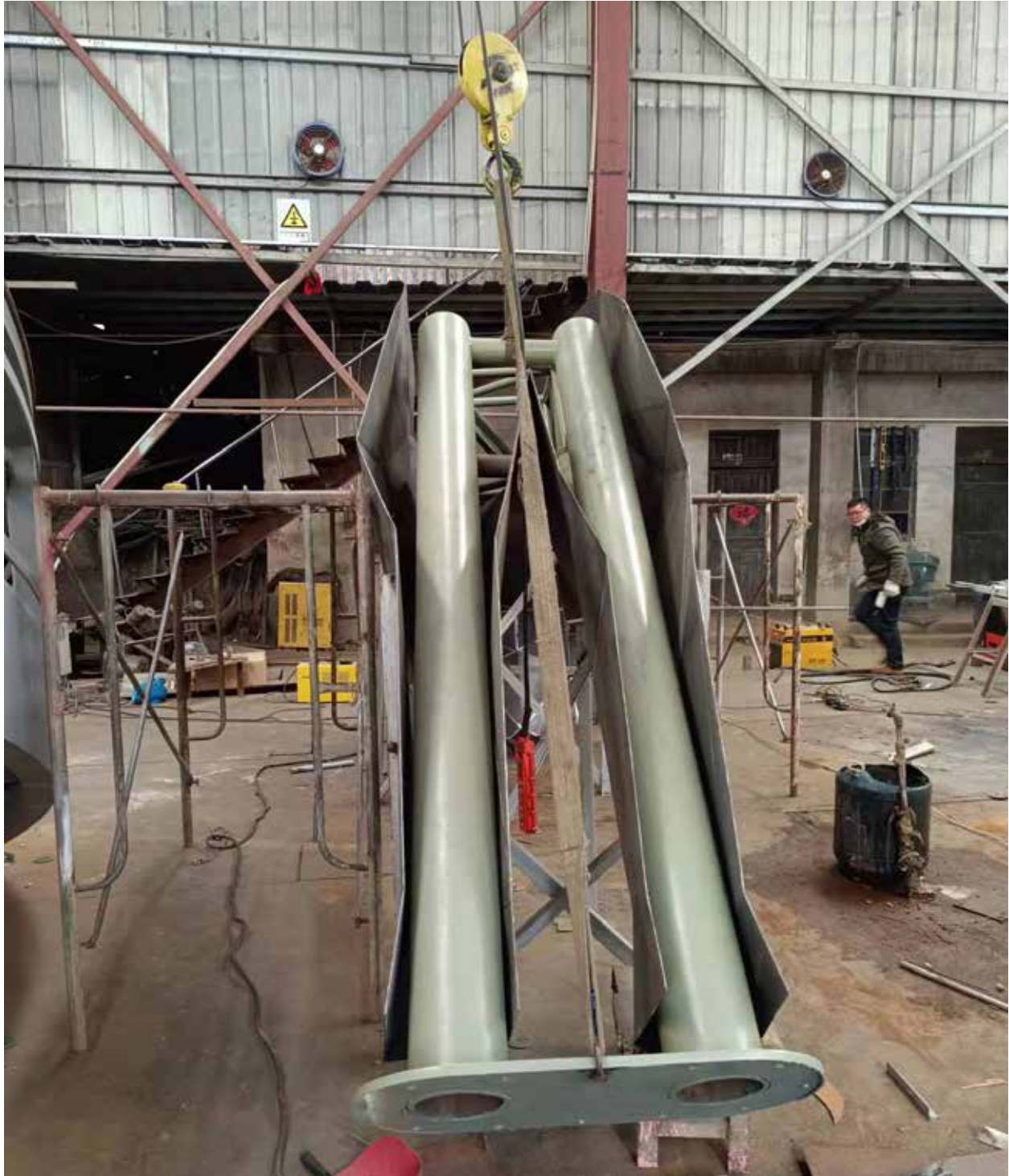
Baseplate and flange weldment inside shell