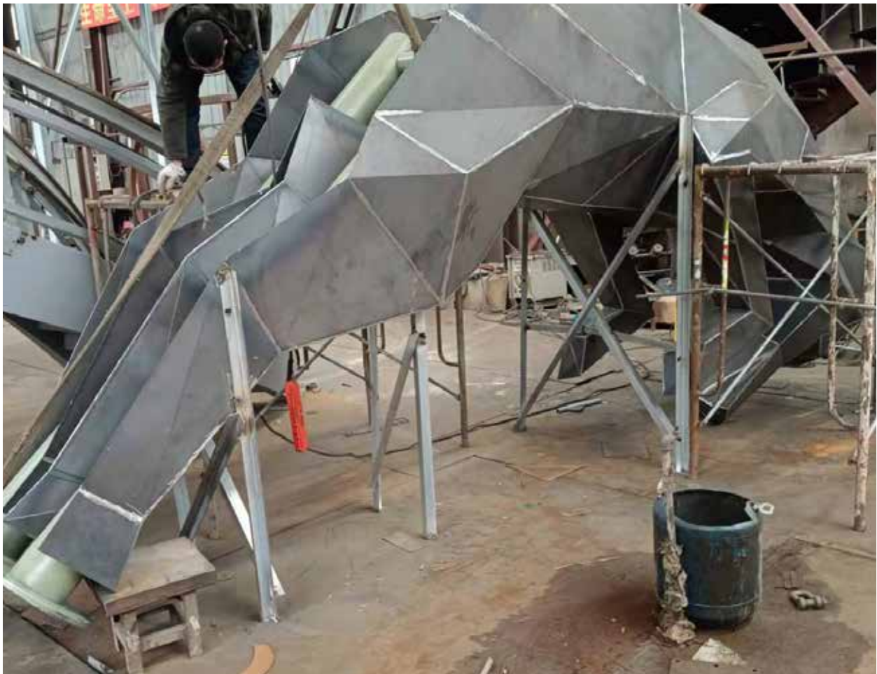
External shell with flange weldment and baseplate