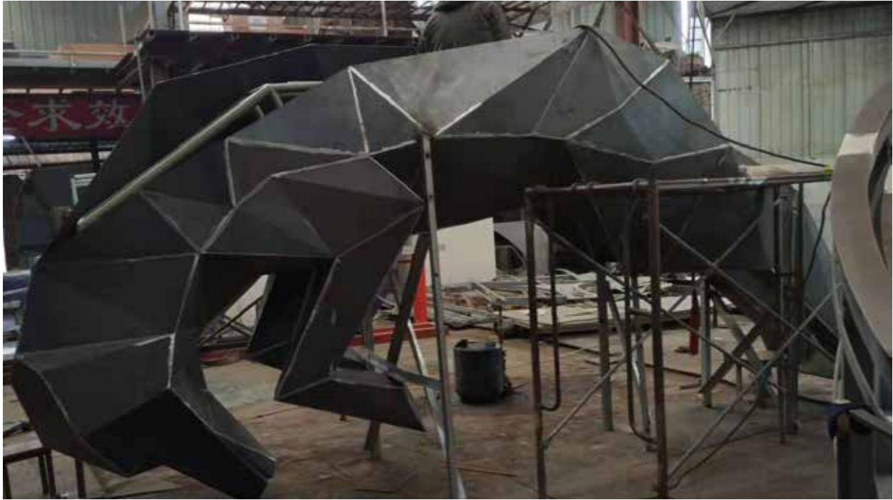
External shell with frame visible